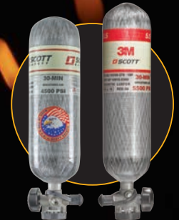
Multiple Cylinder Options (5.5, Snap-Change, 30-Year)