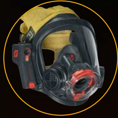
3M™ Scott™ Sight In-Mask Thermal Imager With Pro Package