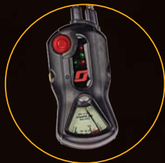
3M™ Scott™ SEMS II Wireless SCBA Telemetry With Pro Package