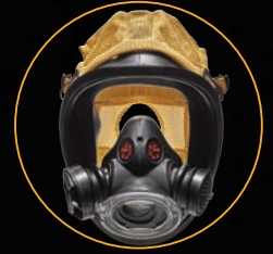
3M™ Scott™ AV-3000 HT Facepiece with E-Z Flo+ Regulator