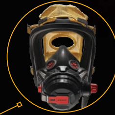
3M™ Scott™ Vision C5 Facepiece with E-Z Flo C5 Regulator