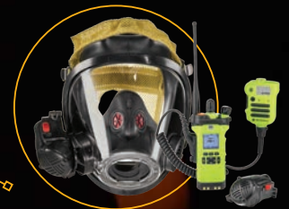
3M™ Scott™ EPIC 3 RDI Voice Communication System